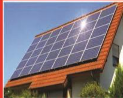
Add Aesthetic Look To Your Roof - Go SOLAR ?

INSTALL "SOLAR POWER SYSTEM" AT "IDLE ROOFTOP" OF YOUR HOME, FACTORY, HOTEL, MALL, SCHOOL OR INSTITUTE !!